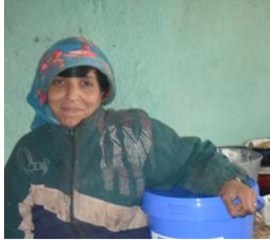
Our support was vital to these families at Christmas